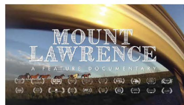
MOUNT LAWRENCE Director