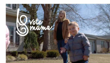
VOTE MAMA Director/Editor