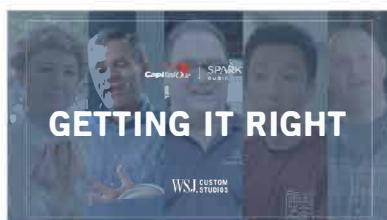
CAPITAL ONE Director/Editor