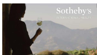
SOTHEBY'S NAPA Director/Editor