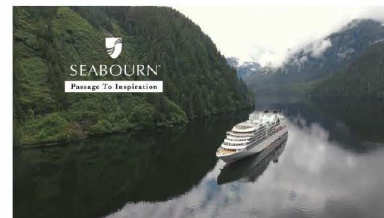
SEABOURN CRUISES Director/Editor